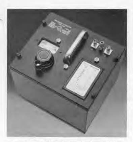
Figure 4. Panel view of a special Type 722 Precision Capacitor calibrated in direct capacitance. The coaxial terminals provide complete shielding for the leads.

frequencies) are about \frac{2}{1} of those of the large sections of other Type 722's. The small sections of dual capacitors have higher residuals. However, the residuals in the capacitor employed in the Type 821-A Twin-T are about \frac{1}{10} of those of the large sections of the usual Type 722, or about \frac{1}{10} of those of a Type 722-N. This capacitor construction, shown in Figure 2, is, although available, rather expensive, since it is not regularly made for separate sale.