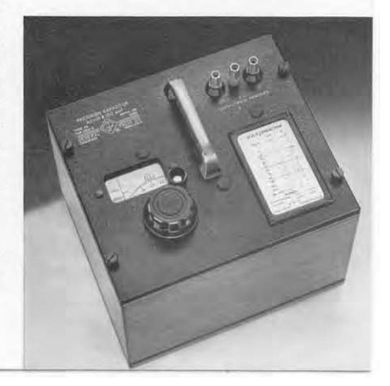
Figure 1. Panel view of the Type 722-ME Precision Capacitor.

places but has, in addition. a 0-100 \mu\mu f \Delta C range. The second model, Type 722-ME, has 0-100 uuf and 0-10 μμf sections. The 10- \mu\mu f section represents the first regular listing of this low, full-scale value. Such units have in the past been available only on special order.