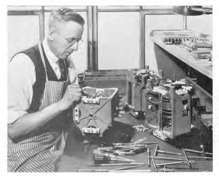
Figure 1. The accuracy and stability of a precision capacitor depend to a great degree upon the care and skill with which it is assembled and aligned. Here, a skilled machinist is assembling a group of capacitors for installation in heterodyne frequency meters.

This may be almost any figure within the limits of 1 \mu\mu f and 1000 \mu\mu f. The capacitance-rotation curve is essentially a straight line except at each end where fringing causes deviations. In stock models, linearity is maintained over slightly more than 150°. Capacitors are manufactured for catalog stock having straight capacitance sections spanning nominally 10, 100, and 1000 \mu\mu f (actually 10.5, 105, and 1050 \mu\mu f). Capacitors have been built with nominal capacitance span of 1 \mu\mu f linear (actually 1.05 \mu\mu f). If